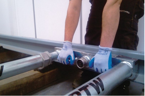
4. Positioning the PTW into the track.