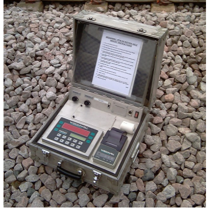
Digital indicator/printer in robust carry case

Accuracy: +/-1% dependent on operating conditions.