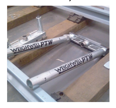
3. Putting the PTW together.