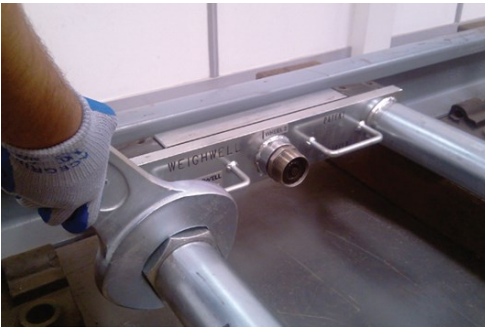
5. Securing the PTW into the track.