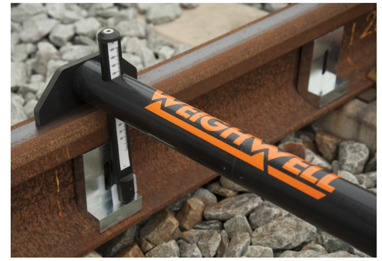
1. The PTW ready to be assembled.