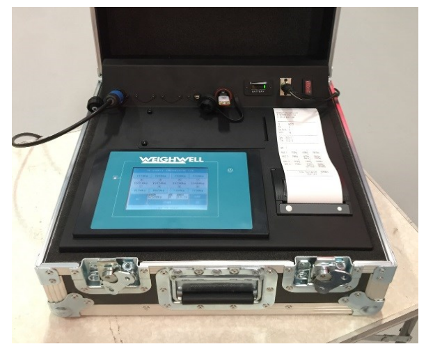
*The PTW is not trade approved and specifications subject to change.

Weighing information on the individual wheel, axle, bogie and railcar can either be printed out or exported multiple times via the use of a USB stick into a .csv file.